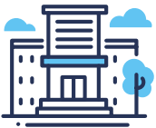
ANNUAL PRICE FULL-TIME CENTER BASED CHILD CARE