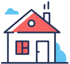
ANNUAL PRICE FULL-TIME FAMILY CHILD CARE