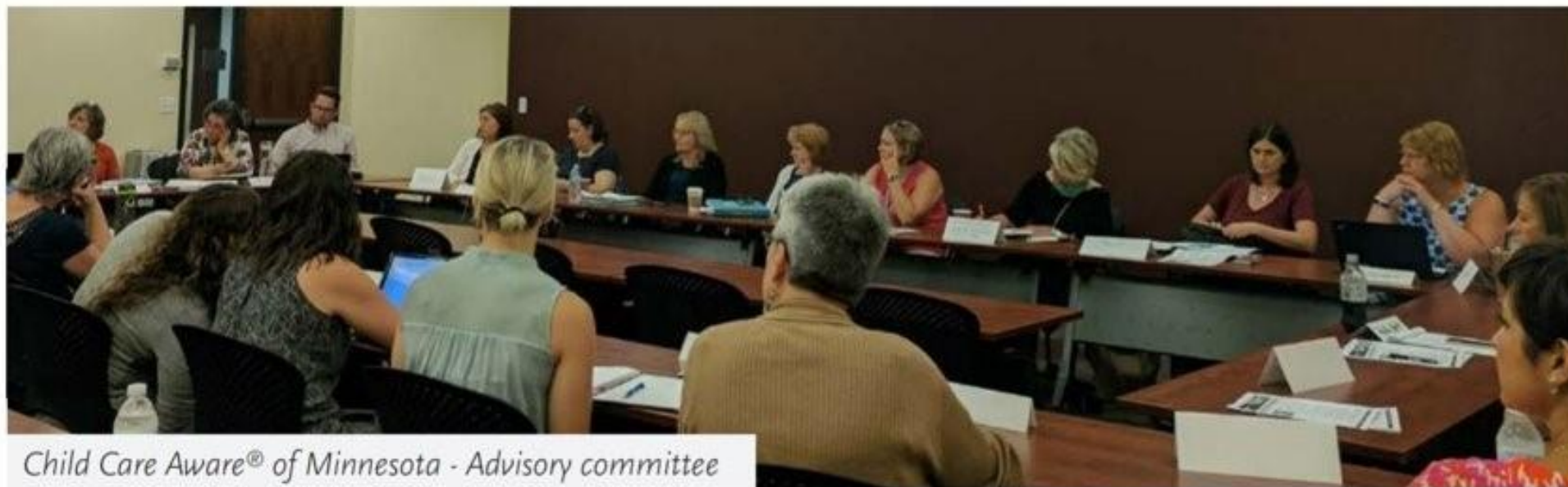
Child Care Aware® of Minnesota - Advisory committee