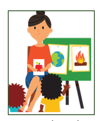
Center-based infant care $8,029