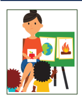
Center-based infant care $13,518