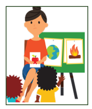
Center-based infant care $11,107