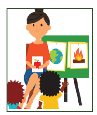
Center-based infant care $20,880